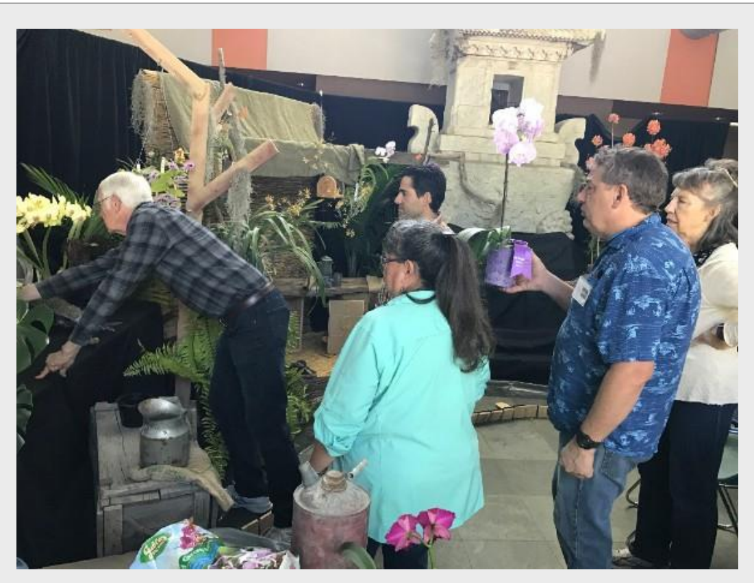
The display coming together